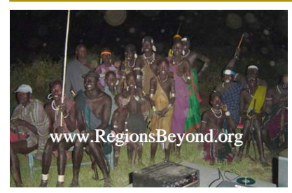
Hearing gospel for the first time